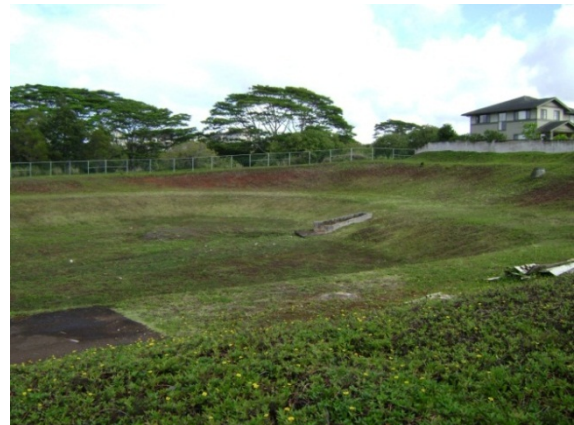
Extended Detention Basin on Oahu

Dry extended detention basins (also known as dry ponds, detention ponds, extended detention ponds) are basins that have been designed to detain storm water runoff from a water quality design storm for some minimum time (e.g., 24 hours) to allow particles and associated pollutants to settle. They can also be used to provide flood control by including additional flood detention storage.