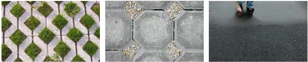
Permeable Hardscape Examples from the City’s “Green Infrastructure for Homeowners” Handbook

Pervious, permeable or porous pavement is a permeable surface with an underlying stone reservoir to temporarily store surface runoff before it infiltrates into the subsoil. There are a few porous pavement options, including porous asphalt, pervious concrete, interlocking paver blocks, and grass pavers. Porous asphalt and pervious concrete appear to be the same as traditional pavement from the surface, but are manufactured without “fine” materials, and incorporate void spaces to allow infiltration. Grass pavers are concrete interlocking blocks or synthetic fibrous gridded systems with open areas designed to allow grass to grow within the void areas.