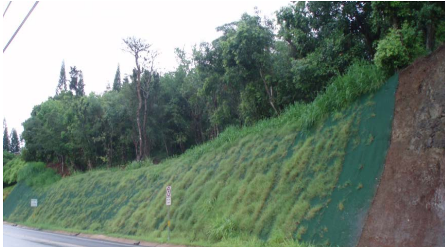
Use of Turf Reinforcement Mats on Kauai

Turf reinforcement mats combine vegetative growth and synthetic materials to form a high-strength mat that helps to prevent soil erosion in drainage areas and on steep slopes. They are composed of interwoven layers of non-degradable geosynthetic materials form a three-dimensional matrix. They are thick and porous enough to allow for soil filling and retention. By protecting the soil from scouring force and enhancing vegetative growth, turf reinforcement mats can raise the threshold of natural vegetation to withstand higher hydraulic forces on stabilization slopes, stream banks and channels. In addition to reducing flow velocities, the use of natural vegetation provides particulate contaminant removal through sedimentation and soil infiltration, and improves the aesthetics of a site.