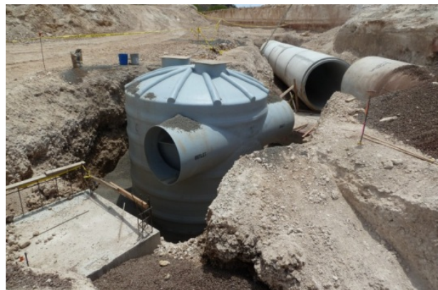
Installation of a Hydrodynamic Separator on Oahu.

Hydrodynamic separators are flow-through structures with a settling or separation unit to remove sediments, floatables and other pollutants. Depending on the type of unit, this separation may be by means of swirl action or indirect filtration. There are several proprietary models, each incorporating slightly different design variations, such as in-line or off-line applications.