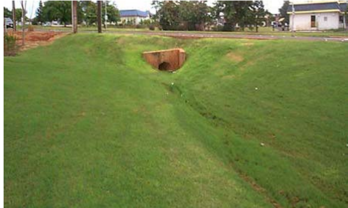
Grass Swale in Central Oahu Regional Park, Oahu

A grass or vegetated swale is an open channel management practice designed specifically to treat and attenuate storm water runoff for a specified water quality volume. As storm water runoff flows through these channels, it is treated through filtering by the vegetation in the channel, filtering through a subsoil matrix, and/or infiltration into the underlying soils. They trap particulate pollutants, promote infiltration, and reduce the flow velocity of storm water runoff. Vegetated swales can serve as part of a storm water drainage system and can replace curbs, gutters and storm sewer systems.