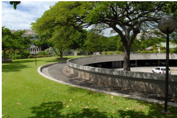
Green Roof at the Fasi Municipal Building, Honolulu, Oahu