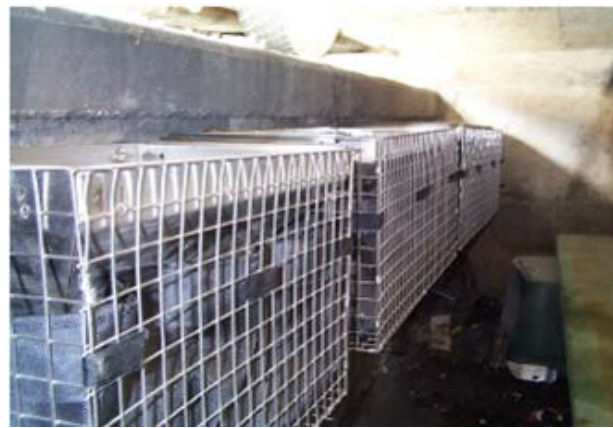
Catch Basin Insert from the City's "Efficiency of Storm Drain Filters in Removing Pollutants from Urban Road Runoff"