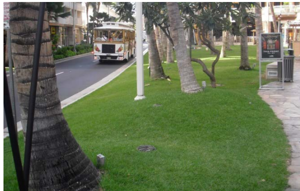
Vegetated Filter Strip in Waikiki, Oahu

Vegetated buffer strips (also known as grassed buffer strips, filter strips, and grassed filters) are vegetated surfaces that are designed to treat sheet flow from adjacent surfaces. Filter strips function by slowing runoff velocities and allowing sediment and other pollutants to settle, and by providing some infiltration into underlying soils.