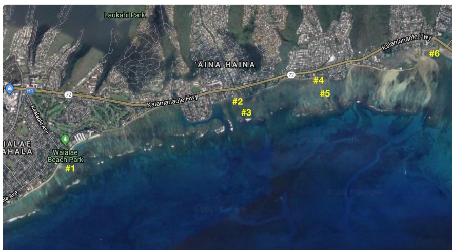
Fig. 1 Stream Mouth and 250 yard approximations for perennial and intermittent streams.

Four streams were chosen from the ten watersheds of Maunalua Bay. These watersheds were determined by the Hawaii Division of Aquatic Resources and published the description of each watershed in the Hawaii Watershed Atlas including their stream type classification. Two of the streams were identified as perennial, consistently flowing throughout the year. Two more were identified as intermittent, flowing periodically based on season and precipitation (Parham, J. E, 2008). Starting at the westmost point to eastmost point, Waialae stream was perennial, Wailupe stream was intermittent, Niu stream was intermittent, and Kuliouou was perennial (See in Fig. 1). In summary, both intermittent streams were located between the two perennial streams in Maunalua Bay. Two more sites were determined approximately 250 yards directly from the mouth of the intermittent stream into the bay. This method of testing further out into the bay was based off of the previous study on Maunalua Bay by the University of Hawaii where they intended to see how present the nutrient levels were dispersed from the stream mouths. Their study also tested the nutrient levels of the perennial stream mouths, Waialae and Kuliouou.